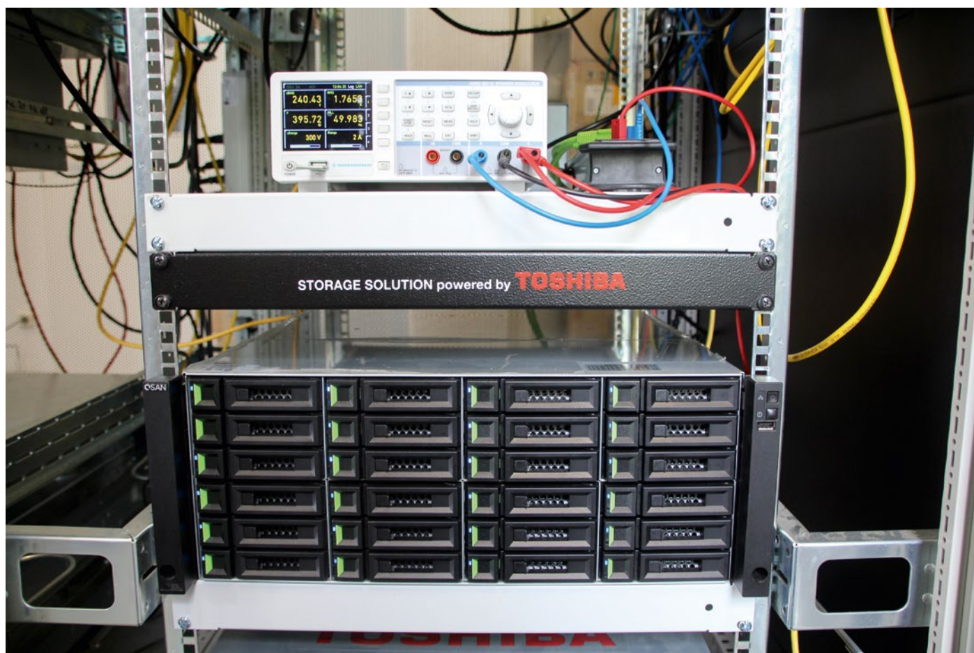
Figure 1: The QSAN XCubeNXT XN5124D in Toshiba’s HDD Lab

age (NAS) providing shared folders/file system or as block storage for dedicated storage area networks (SAN) like iSCSI, Fibre Channel, or even both in parallel. QSAN promotes it as “the newest generation of XCubeNXT that harnesses industry-leading versatility for mixed workloads.” Additionally, the highly available and secure multiple protocol and cross QSAN platform support is claimed as being the best Total Cost of Ownership (TCO) for capacity demanding applications.