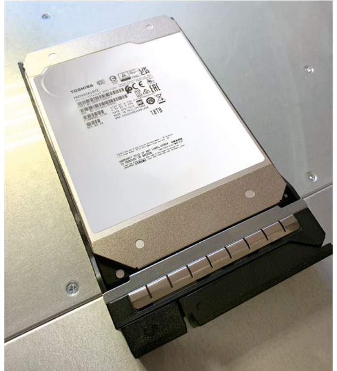
Figure 2: Toshiba MG09SCA18TE Enterprise SAS HDD

For reference: The model version tested was XS3324D, with Firmware Version 2.2.1.