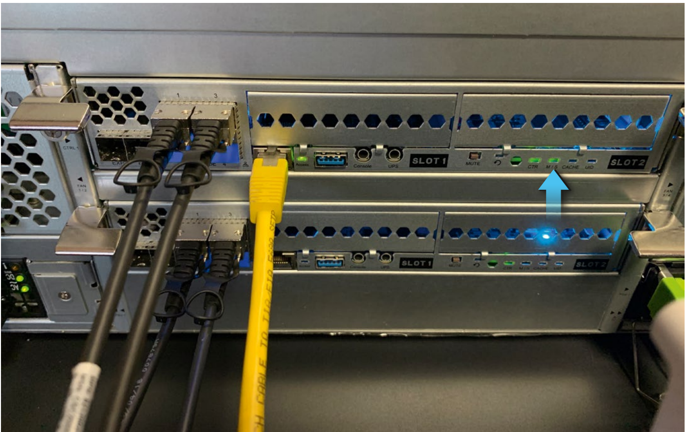
Figure 3: XS3324D Network Connections