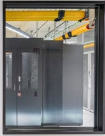
Technology Experience Lab in Frankfurt