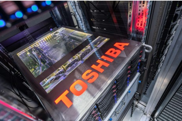
Server and Storage in the Technology Experience Lab