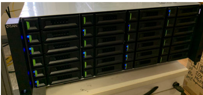
Figure 1: The QSAN XN8024D

The model provided for testing was QSAN's XN8024D, a 4U/24-bay front loading fully integrated unified storage solution with dual/redundant SAS controller and power supply (Figure 1). It can operate both as network-attached storage (NAS), providing traditional shared files and folders, and simultaneously as block storage for dedicated storage area networks (SAN). This is support over iSCSI, fibre channel, or both. Due to its dual-controller architecture, providing a dual-path from network down to HDD access, it is best suited to high-capacity, SAS Nearline HDDs. It features a number of field replaceable units (FRU) that can be hot swapped in the unlikely event of component failure.