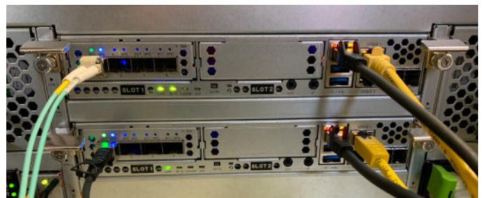
Figure 3: Two 10GB/s SFP+ connections (left) together with the 10GbE LAN (yellow cables) and 1GbE management (black cables) ports (right).

To fully test its large-scale capabilities, 24 of Toshiba's top Enterprise Capacity MG-Series HDD were installed: the 16 TB SAS 12Gb/s model MG08SCA16TE (Figure 2). Each of the controllers was connected to a dedicated storage area network over 10GB/s SFP+ connections using the installed 4-port module. For the purposes of evaluation, only a single-path network connection was used. In a production environment, a dual-path connection could be used, providing a stable and reliable connection from the HDDs to the client/user. In addition, two further 10GbE LAN connections were made, while the 1GbE management ports were connected to allow access to the browser-based configuration interface of the QSM operating system.