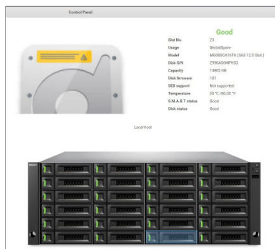
Figure 5: One XN8024D 12 HDD pool reconfigured with an SSD cache (left); 11th HDD remains as global hot spare drive (right).