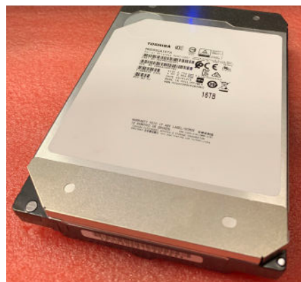
Figure 2: Toshiba HDD 16TB SAS MG08SCA16TE

To fully test its large-scale capabilities, 24 of Toshiba's top Enterprise Capacity MG-Series HDD were installed: the 16 TB SAS 12Gb/s model MG08SCA16TE (Figure 2). Each of the controllers was connected to a dedicated storage area network over 10GB/s SFP+ connections using the installed 4-port module. For the purposes of evaluation, only a single-path network connection was used. In a production environment, a dual-path connection could be used, providing a stable and reliable connection from the HDDs to the client/user. In addition, two further 10GbE LAN connections were made, while the 1GbE management ports were connected to allow access to the browser-based configuration interface of the QSM operating system.