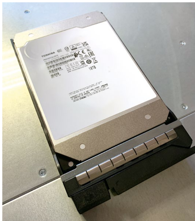
Figure 2: Toshiba MG09SCA18TE Enterprise SAS HDD

For reference: The model version tested was XS3324D, with Firmware Version 2.2.1.