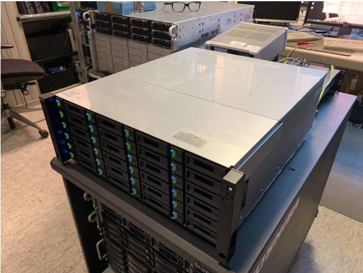
Figure 1: The QSAN XS3324D

The model provided for testing was QSAN's XS3324D, a 4U/24-bay front loading fully-integrated storage area network (SAN) block-storage solution with dual/redundant SAS controller and power supply (as described in Figure 1). It operates as block storage for dedicated SANs. This is support over iSCSI, fibre channel (with optional FC modules – not tested), or both. Due to its dual-controller architecture, providing a dual-path from network down to HDD access, it is best suited to high-capacity, SAS Nearline HDDs. It features a number of field replaceable units (FRU) that can be hot-swapped in the unlikely event of component failure.