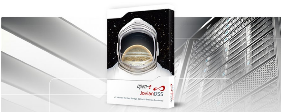
Figure 4: Open-E's JovianDSS software

Finally, the 60 HDDs were configured to form a storage pool in a software-defined storage environment, a ZFS (zettabyte file system), managed by the JovianDSS software from Open-E.