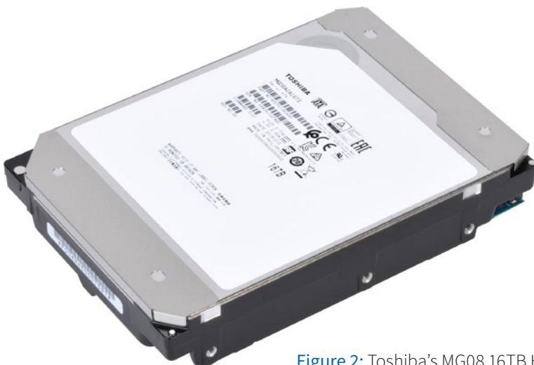
Figure 2: Toshiba's MG08 16TB HDD

The corresponding 16TB HDDs of Toshiba's MG08 series are available with SAS or SATA interfaces. The SAS interface has two 12GB/s channels, making it suitable for architectures where speed and, above all, high availability are important. This comes at the expense of power dissipation (SAS HDDs consume roughly 1-2W more power than SATA HDDs, due to the higher power consumption of the interface). Since one goal was to optimise for power dissipation, the MG08ACA16TE model with SATA interface was chosen.